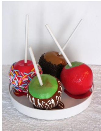
“Four Taffy Apples” by Stanford Slutsky 15 x 15 x 15