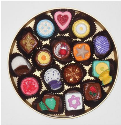
Round Candy Box 16" round

Stanford Slutsky tells The Rickie Report, “I’m chasing the sweet thing in life”!